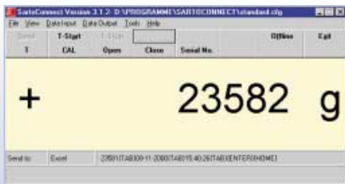
Example: MS Excel 5.0 diagram